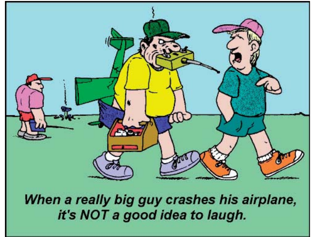
When a really big guy crashes his airplane, it's NOT a good idea to laugh.

Saturday and Sunday or after hours telephone 581-1990